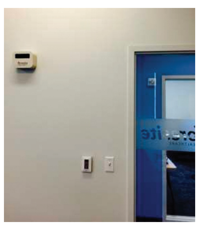
Figure 1. The integrated Foresite Healthcare data logger computer and depth sensor unit, sized at 5\times7\times3 in. mounted on a wall.

of walking events (Stone et al., 2015) daily. The system estimates stride length, stride time, and walking speed by analyzing the motion of three-dimensional silhouettes. The system averages TUG, derived from the sensor technology, which was sent to the research team via password-protected website (for correlations, see previous study; Stone et al., 2015). The algorithm for the TUG averages was developed by using TUG in-laboratory measures to compare with measures produced by an algorithm based on average in-home gait speed data from the depth sensor. The sensor was available by lease at a low cost (Wang et al., 2013) that allows for translation to other populations (Rantz et al., 2013).